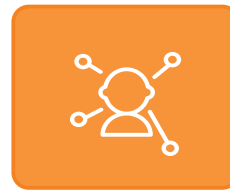
Social Media Collaboration