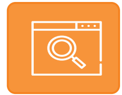
Blazing Fast Search