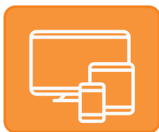
Enhanced Device Support

Intel Core I3 4 GB RAM 80GB Hard disk Capacity Gigabit network Adapter Windows 7/8/10, Mac & Linux with GUI